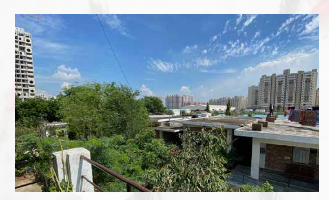
View from the Ashram to the South

The Sewa Ashram and the Learning Center have been surrounded by construction activity for years and are now framed by towering apartment buildings with up to 24 floors. The area has become the largest urban development project of the state-run Delhi Development Authority (DDA).