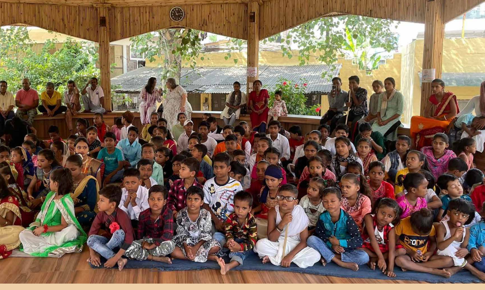
Children from the Learning Center at the Circle on National Day