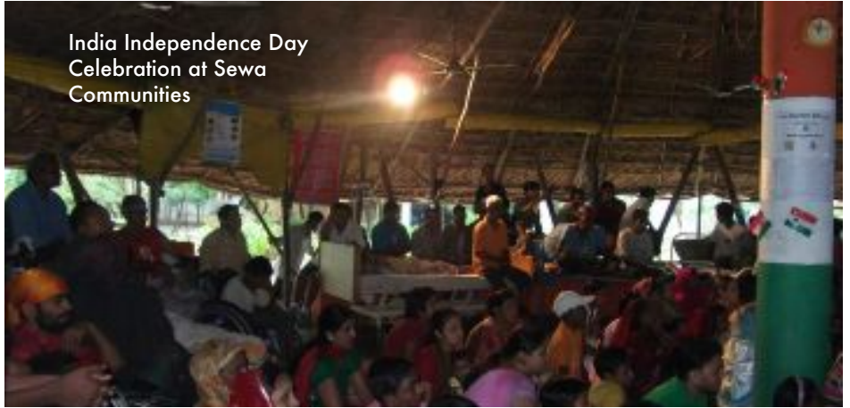
India Independence Day Celebration at Sewa Communities