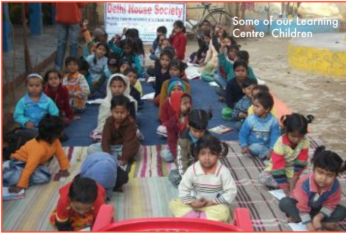
Some of our Learning Centre Children